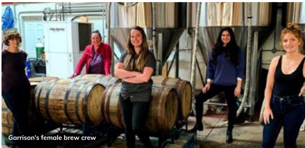
Garrison's female brew crew

For the third year in a row, Garrison Brewing held their International Women's Day fundraiser in support of women in trades at NSCC.