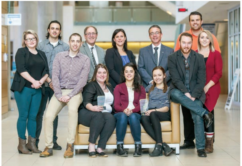
Enactus NSCC Waterfront Campus wins third place in their league at Enactus Canada National Expositions.

Enactus NSCC Waterfront Campus presented four of their projects in front of a panel of more than 20 judges. Locally, they partnered with the Boys and Girls Club of Canada to deliver financial