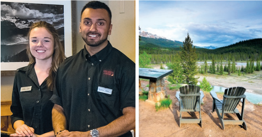
Tekarra Lodge employees