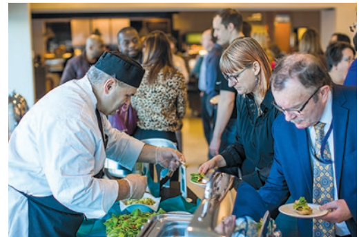
Guests enjoy a wonderful banquet showcasing the talents of Chartwells' chefs

It will support students in urgent need of food relief at the four campuses where Chartwells is present: Ivany, Institute of Technology, Truro and Kingstec.