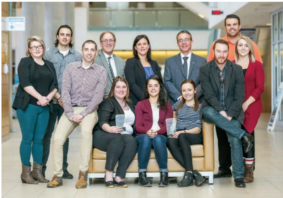
Enactus NSCC Waterfront Campus wins third place in their league at Enactus Canada National Expositions.

Enactus NSCC Waterfront Campus presented four of their projects in front of a panel of more than 20 judges. Locally, they partnered with the Boys and Girls Club of Canada to deliver financial