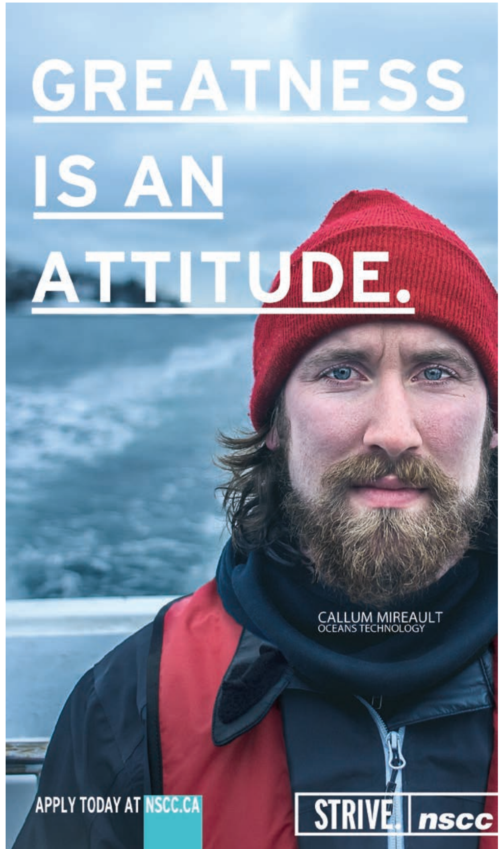
Strive cinema poster.

To view the Strive films visit nscC.ca/strive