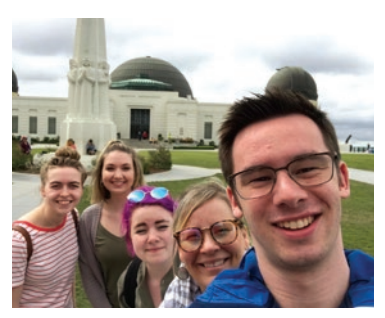
NSCC students in Los Angeles

Thanks to the generosity of donors, the NSCC Foundation is able to provide funding each year for special projects and initiatives that enhance student learning outcomes while supporting NSCC's mission.